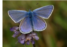
COMMON BLUE Bird's-foot Trefoil

Blue, clear white border. Often near its foodplant. Female is brown not blue.