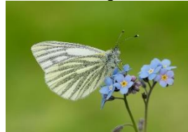
GREEN-VEINED WHITE Garlic & Hedge Mustard

Damp, lush areas. Similar to other whites but has streaked, greeny-grey lines on underside.