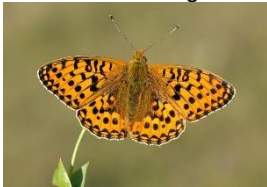
DARK GREEN FRITILLARY Dog-violet

Large, orange & black, white dots on underside, On chalk grass w/scrub. Unusual to find in this landscape.