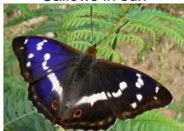
PURPLE EMPEROR Sallows in sun

Vey big. Flies at top of canopy. Mud-puddles.