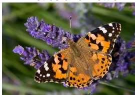
PAINTED LADY Thistles and Nettle

Migrant. Big, orange w/black and white tips. Grey-ish underside