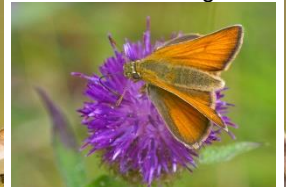
SMALL SKIPPER Yorkshire-fog

Tiny, orange, triangular. Very similar to Essex Skipper. Underside of antennae tips are orange