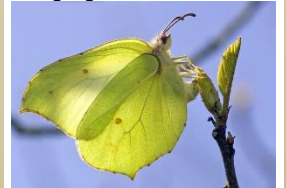
BRIMSTONE Purging/Alder Buckthorn

Buttery or greeny-yellow colour. Pointy wing-tips. No black. Female is paler.