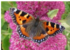
SM. TORTOISESHELL Nettle

Anywher with nectar. Rich Orange and black markings. Plus blue dots