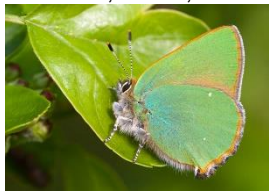
GREEN HAIRSTREAK Rockrose, Gorse, Broom

Our only green butterfly. Perches with wings closed on shrubs