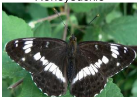
WHITE ADMIRAL Honeysuckle