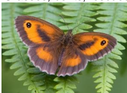
GATEKEEPER Grasses, bents, fescues

Orange with brown. 2 white dots in black circle.