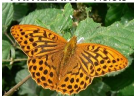
SILVER-WASHED FRITILLARY - Violets

Large & orange. Usually in sunny oak woods & rides. Glides in flight.