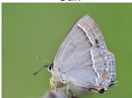
PURPLE HAIRSTREAK Oak

Small, grey triangle at top of sunny oaks. Look on sunny evenings.