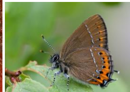
BLACK HAIRSTREAK Blackthorn

Rare. Small. Black dots in orange border. Woodland edges, hedgerows & thickets.