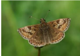
DINGY SKIPPER Vetches and trefoils

Very rare. Small, brown, indistinct markings