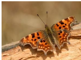
COMMA Nettle and currants

Our only butterfly with a wavy edge. On scrub woodland edges.