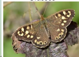
SPECKLED WOOD Grasses

In sun-speckled wooded clearings with grasses