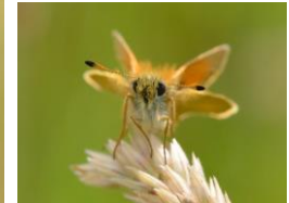
ESSEX SKIPPER Cock's-foot

Tiny, orange, triangular Very similar to Small Skipper. Underside of Antennae tips are jet black