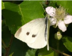
SMALL WHITE Various Crucifers

Grey/black marks/smudges at the wing tips, don't extend along outer edge.