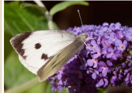
LARGE WHITE Various Crucifers

L argest black marks at wing tips, continuing along the outer edge. in an unbroken, L shape