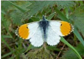
ORANGE-TIP on Ladies Smock, Garlic Mustard

Wing-tips are rounded - orange for the male, grey for the female. Both have blotchy green 'camouflage' underside.