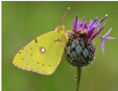
CLOUDED YELLOW Clovers, nectar-sources

Uncommon migrant. Looks golden in flight with black wing tips.