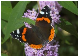
RED ADMIRAL Nettle

Big, bold, dark butterfly with orange or red marks