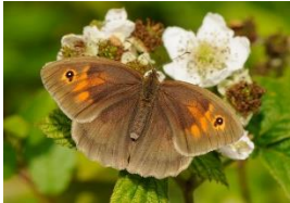
MEADOW BROWN Grasses, bents, fescues

Medium. Dusty brown with orange 1 white dot in black circle.