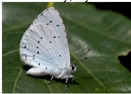
HOLLY BLUE Holly, Ivy

Pale blue. In gardens, parks, churchyards. No orange on underside