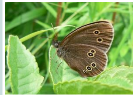
RINGLET Lush Grasses

Dark with white border. Underneath it has white ringed eyes. On scrub.