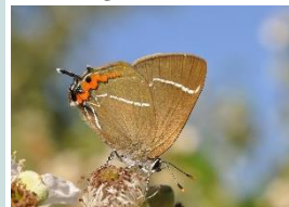
WHITE-LETTER HAIRSTREAK - Elm

Grey-brown. Black line inside orange edge. Flits around elms. More orange/brown than Purple Hairstreak.