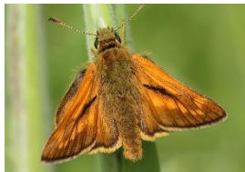
LARGE SKIPPER Cock's-foot

Orange w/lighter squares. Roosts on tall scrub & twigs.