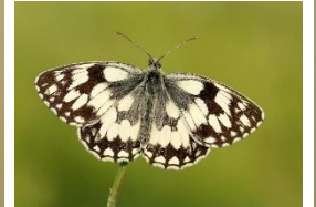
MARBLED WHITE Red fescue

Large butterfly. Black & white chequerboard pattern