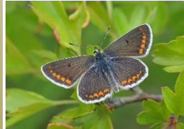
BROWN ARGUS Common Rock-rose

Small, Brown with strong orange 'lozenges' on all wing edges