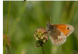
SMALL HEATH Fine grasses, fescues

Very small. Dusty, orange w/ rounded wings. Always rests with wings closed and short white streak always visible.